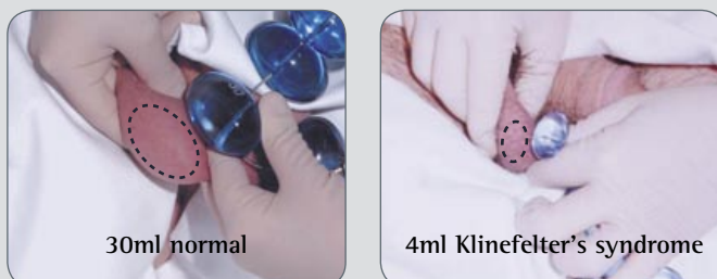
FIGURE 2 – EXAMPLE OF 30ML AND 4ML ADULT TESTIS

Features present may be few, some or all.