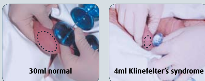
FIGURE 2 – EXAMPLE OF 30ML AND 4ML ADULT TESTIS